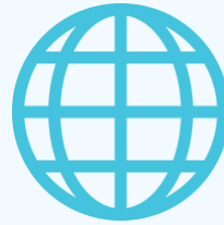
United Nations Agencies