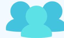
Standard Development Organizations (SDOs)